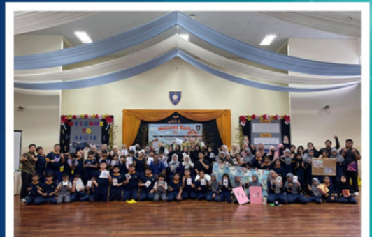
Language Land Adventure: AIU BEE Students Host Engaging English Program in Collaboration with AIU International School

Organised by: Bachelor of Elementary Education (BEE)'s Students & AIU International School (AIUIS)