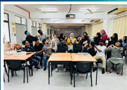
Mic check! AIU's Emcee Workshop builds confidence and charisma