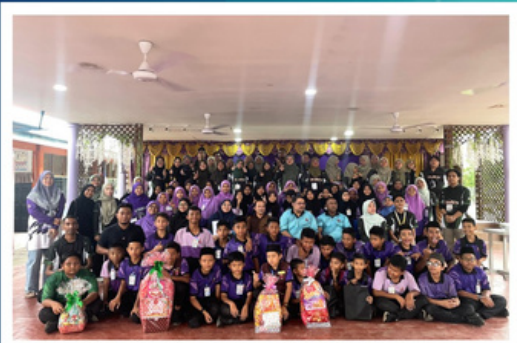
Building Young Minds: AIU and UiTM Kedah Bring Empowering Learning Experiences to the Students of SK Dato' Shaari