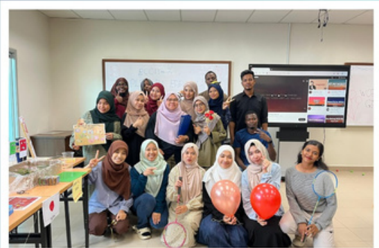
BECE Hosted the Children's World Culture Games Showcase, Celebrates Global Traditions

Organised by: Bachelor in Early Childhood Education (BECE)'s Students