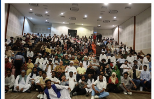
SSC.AIU Commemorates Sudan's Independence Day with Tradition and Unity

Organised by: Sudanese Students Community