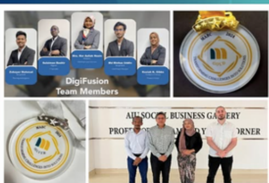
AIU Students Shine at the Malaysian Analytical Business Challenge (MABC) 2024